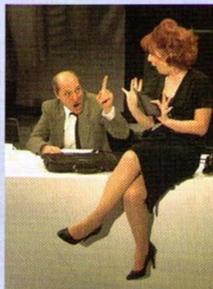
Scenes from the RSN Production, "Who Lives?"

RSN's five nominations for "Who Lives?" were as follows: